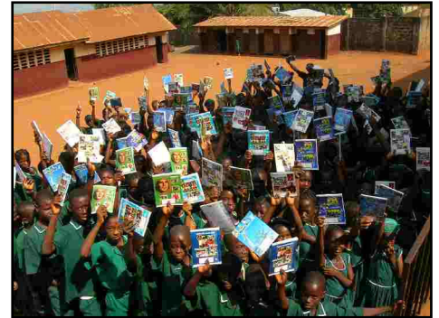
Kids at UMC Ginger Hall Primary showing off their new textbooks.